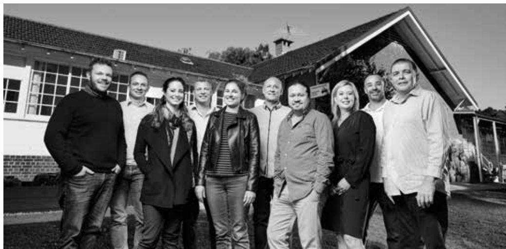
Foundation House Clinical Team